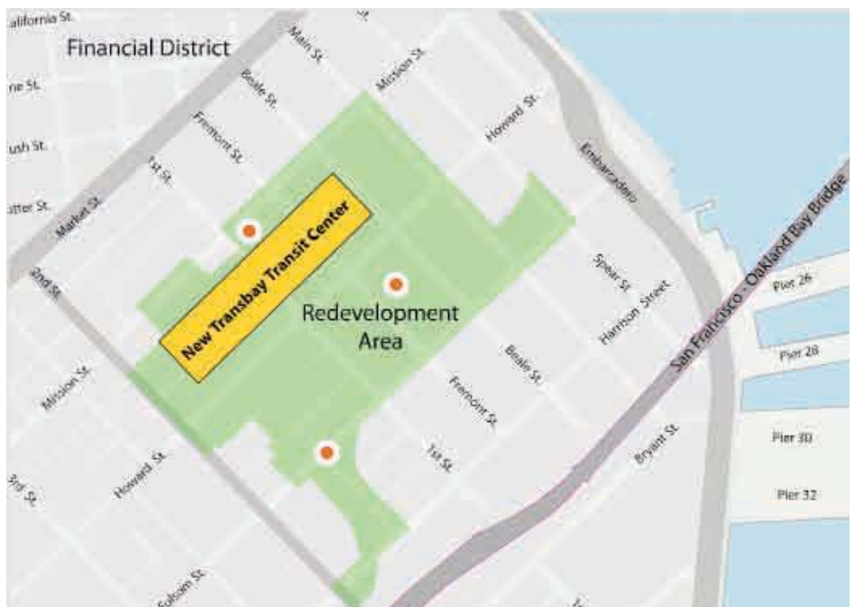
More than a station, plans for the new Transbay Terminal hope to transform an entire neighborhood.