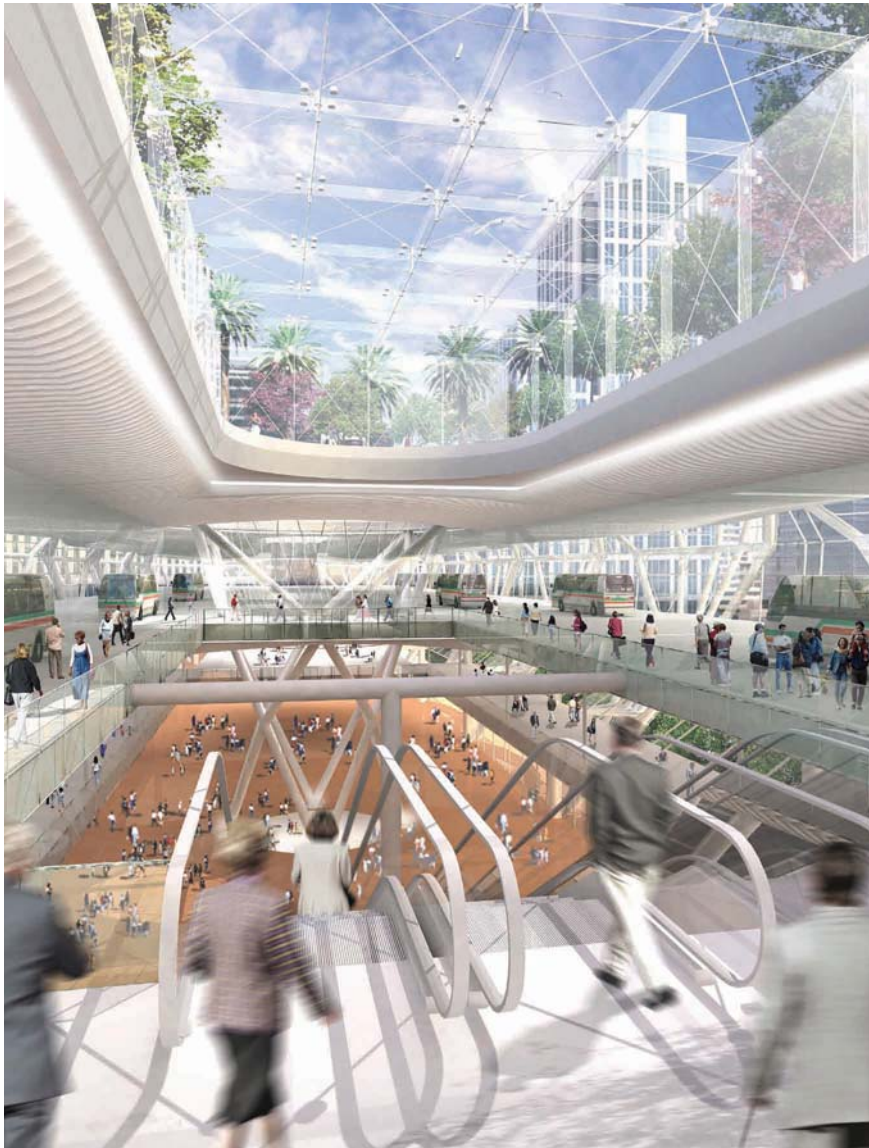
Plans for the new Transbay call for several bus ramp levels and vibrant retail options – all to entice more travelers.

state of the Transbay Terminal, plans for a new station have been bandied about for decades, but today a clear plan has emerged – and it’s one of the nation’s most ambitious transit projects.