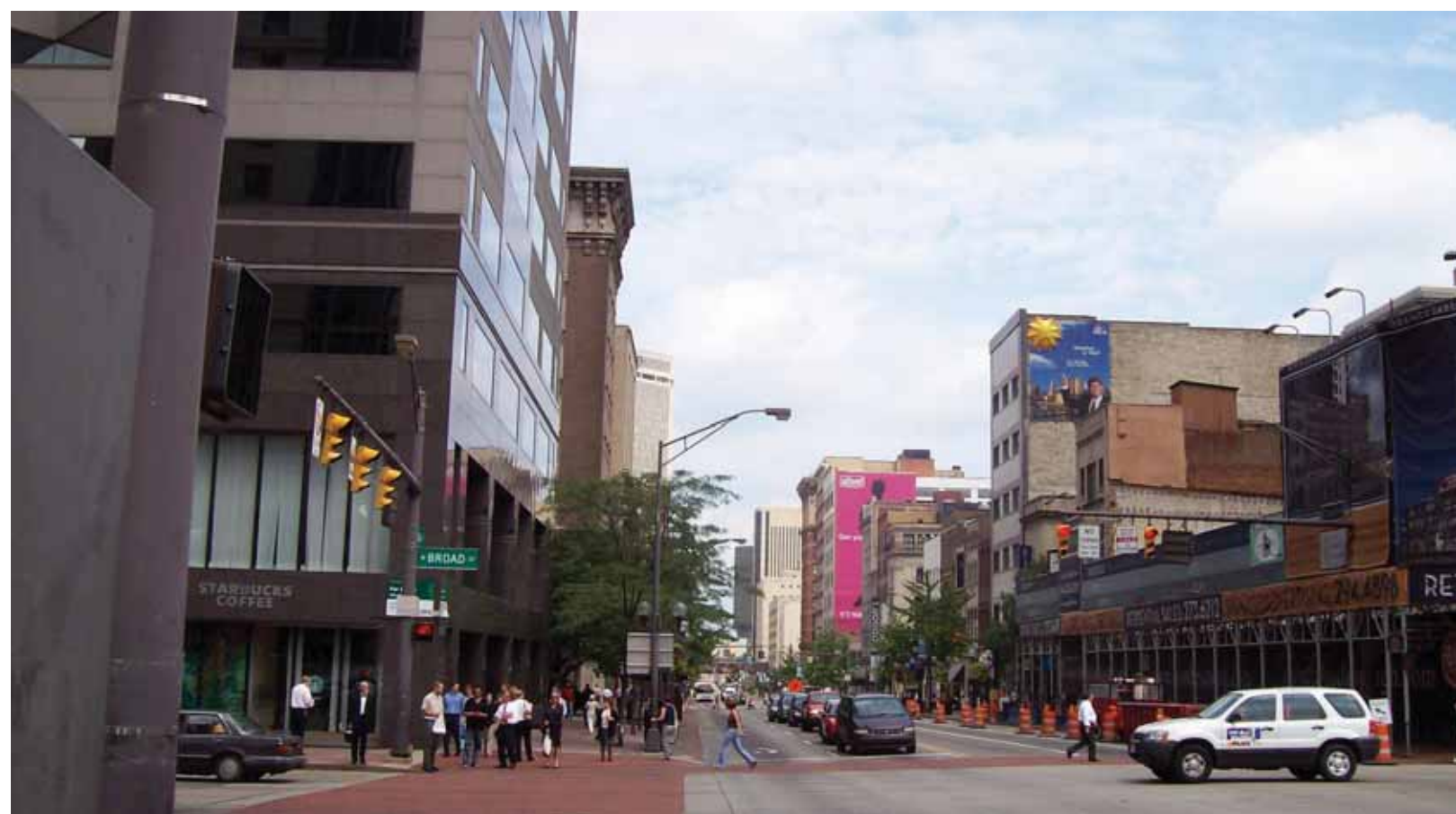
Broad & High Streets in downtown Columbus, during the heyday of streetcars in 1914 (l) and today (r). The intersection would likely be at the heart of the city's new streetcar system.