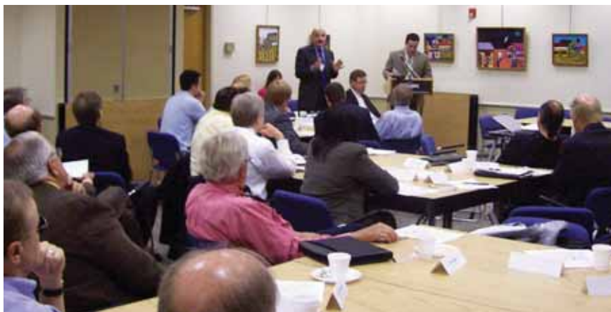
Admiral Denny McGinn (below left) leads a meeting of the Columbus Streetcars Working Group (above).

of streetcars in Columbus. They held their first meeting in April 2006, just two months after the Mayor's proposal, and quickly determined they needed to learn as much about streetcars as quickly as possible. They studied streetcars systems in contemporary use, where and why they have been implemented elsewhere, and how they had been designed and deployed. The group investigated recently opened