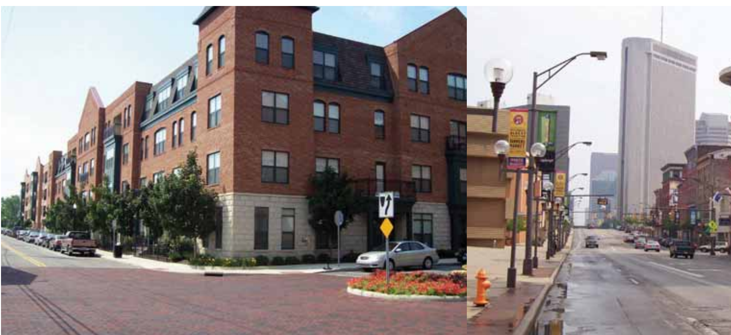
Streetcar service is planned to link development projects in the German Village (left), Convention Center area (middle) and the Short North (right), among other downtown Columbus districts.

that a more focused rail circulator service could further enhance and drive development, especially in the Pearl District collection of underutilized warehouses and industrial plots north of the central business district. Ultimately, through a voting process, downtown business owners authorized a tax of $11.2 million to help support the project, which was launched in 2001.